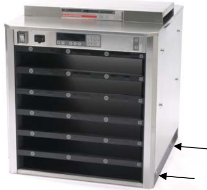
Fig 1: Two screws (see arrows) at the base of each side of the cabinet secure the sides.

*Instructions are the same for each kit. Bezel provided is dependent on part number ordered.